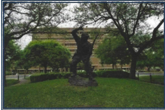
Audie L. Murphy Memorial Veterans Hospital